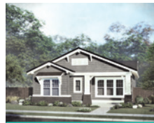
MINNIE BELLE - BUNGALOW 2 beds, 2 baths, 1590 ASF, 2 car

COUNTER IN PANTRY & WALK-IN CLOSET IN BOTH BEDROOMS