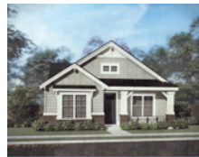
BLACK FOREST - BUNGALOW 3 beds, 2 baths, 1545 ASF, 2 car

COUNTER IN PANTRY & WALK-IN CLOSET IN BOTH BEDROOMS