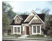
WINTER SUNSET - BUNGALOW 3 beds, 2 baths, 1660 ASF, 2 car