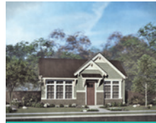
FOX TROT - BUNGALOW 2 beds, 2 baths, 1700 ASF, 2 car