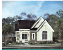
PRAIRIE HARVEST - BUNGALOW 2 beds + Flex, 2 baths, 1665 ASF, 2 car