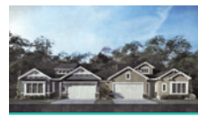
RADIANCE - VILLA 2 beds + Den, 2.5 baths, 2080 ASF, 2 car

DOOR TO PATIO FROM MASTER BEDROOM & JUNIOR SUITE WITH TILE SHOWER